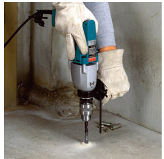
Photograph : Model HP2010N