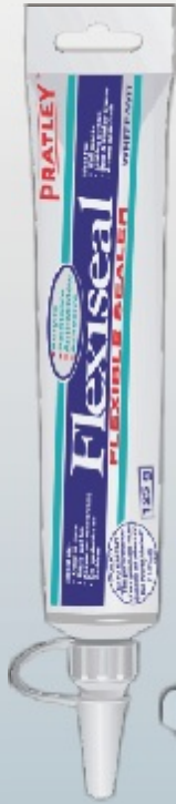
Cat. no. 93002 125g Tube