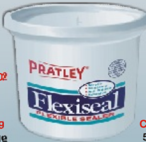
Cat. no. 93007 500ml Bucket

Excess product may easily be washed off with water before it is cured.